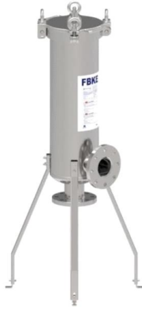
Approximate picture. End caps and height's choice will lead to the assembly of a product which could differ from those shown in figure