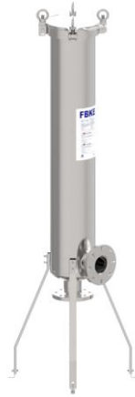
Approximate picture. End caps and height's choice will lead to the assembly of a product which could differ from those shown in figure