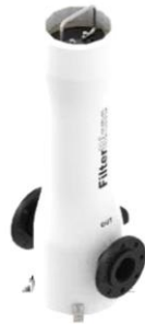
Approximate picture. End caps and height's choice will lead to the assembly of a product which could differ from those shown in figure