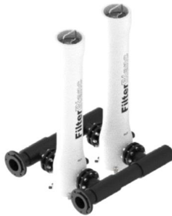
Approximate picture. End caps and height's choice will lead to the assembly of a product which could differ from those shown in figure