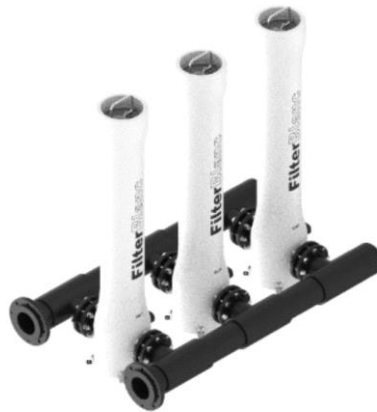
Approximate picture. End caps and height's choice will lead to the assembly of a product which could differ from those shown in figure